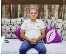
(PRINCIPAL) C.R. Polytechnic Rohtak